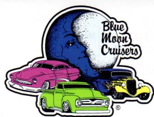
Sunday, July 14, 2024 9am to 4pm New Kingstown Fire Company 277 North Locust Point Road New Kingstown, PA